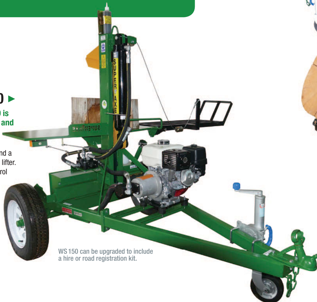
WS 150 can be upgraded to include a hire or road registration kit.

The WS 150 features robust construction, a large work bench and a 150kg capacity, cable operated log lifter. The innovative double handed control system ensures ease of use, quick cycle times & unmatched safety. A 9hp power pack is fitted as standard, but a 6hp power pack is also available. The 9hp power pack delivers a whopping 21 tons of splitting power and a 7 seconds cycle time.