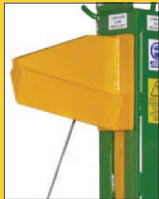
Patented vertical action sliding blade

vertical sliding blade and control system, the splitters are Australia's only.