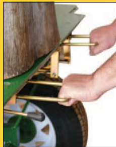
Double handed control system keeps hands safe