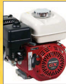
GX series Honda engine