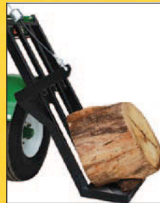
Back saving log lifter