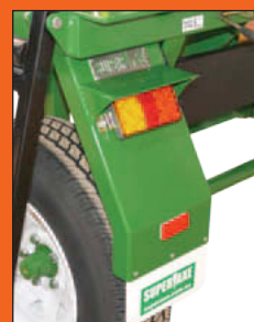
Heavy Duty Mudguards & quality LED lights