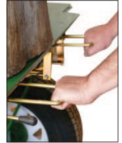
Hand Controls – Keeps Hands Safe Easy to use Work Cover Compliant