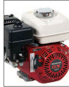
Your choice of engine: Honda or Robin