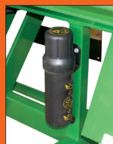
Safety manual in canister attached to the machine