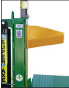
Patented Vertical Splitting Action Blade 21 Tons Force