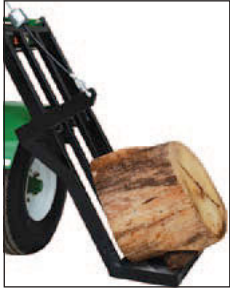
Back Saving Log Lifter 150 Model: Cable & Pulley 3150 Model: Hydraulic

Whitlands Engineering has been designing and building firewood machinery in Australia since 1993. The Superaxe range of wood splitters are the most efficient & productive machines on the market. As part of a hire inventory, Superaxe will deliver a superior return on investment and keep your customers safe and completely satisfied.